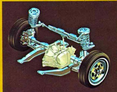
Front-wheel drive provides impressive traction, while permitting more spacious interiors.

Notice the way Firenza hugs the road and takes corners. That's front-wheel-drive traction at work. It keeps you going in snow, sand or rain. Thanks to MacPherson strut suspension up