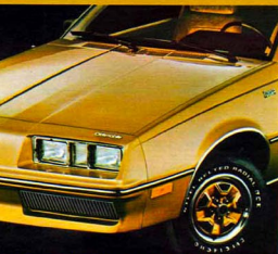
Firenza. This is what a small car can be when it's an Oldsmobile.

The newest look of Oldsmobile quality. And how it got to be this way. The sleek, aerodynamic Oldsmobile Firenza is more than just a new car. It is the product of the latest technology and innovation, designed for impressive reliability, economy, performance — and quality.