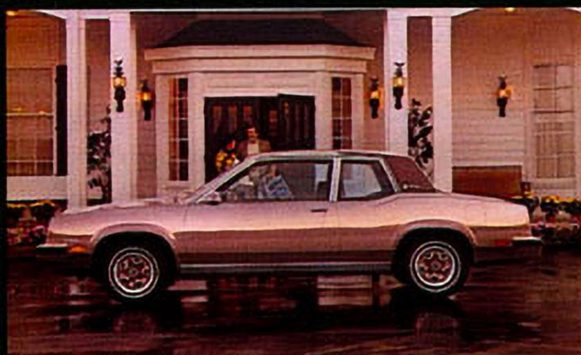
OMEGA BROUGHAM COUPE