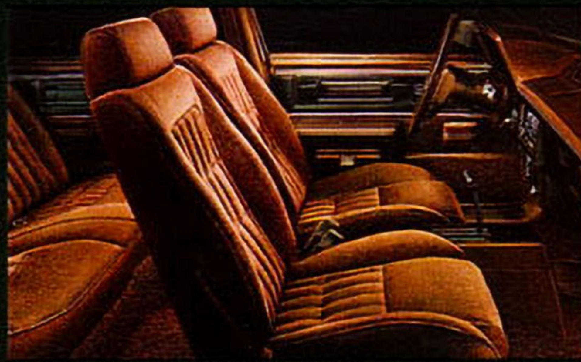
FIRENZA CRUISER INTERIOR.