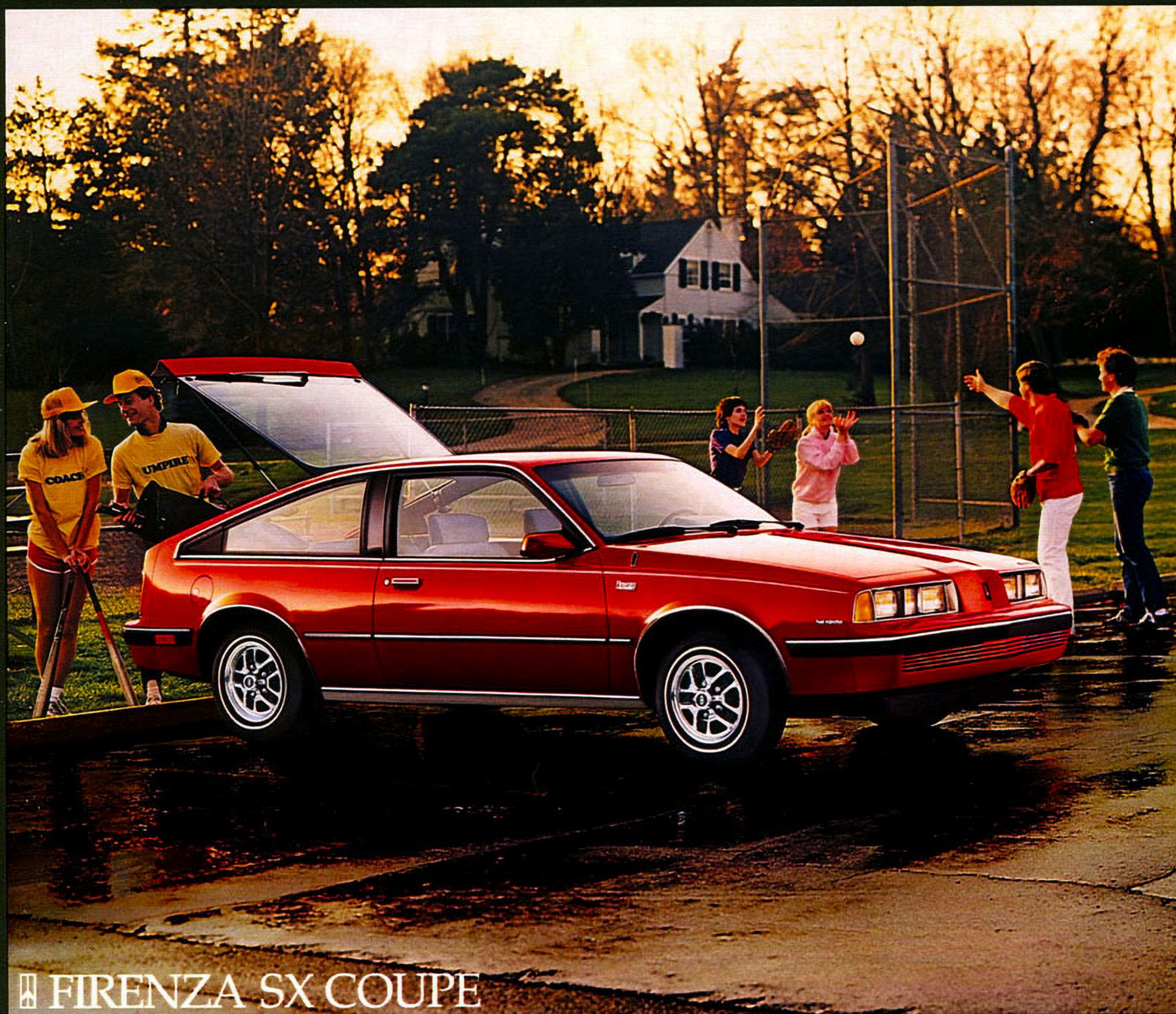
▣ FIRENZA SX COUPE