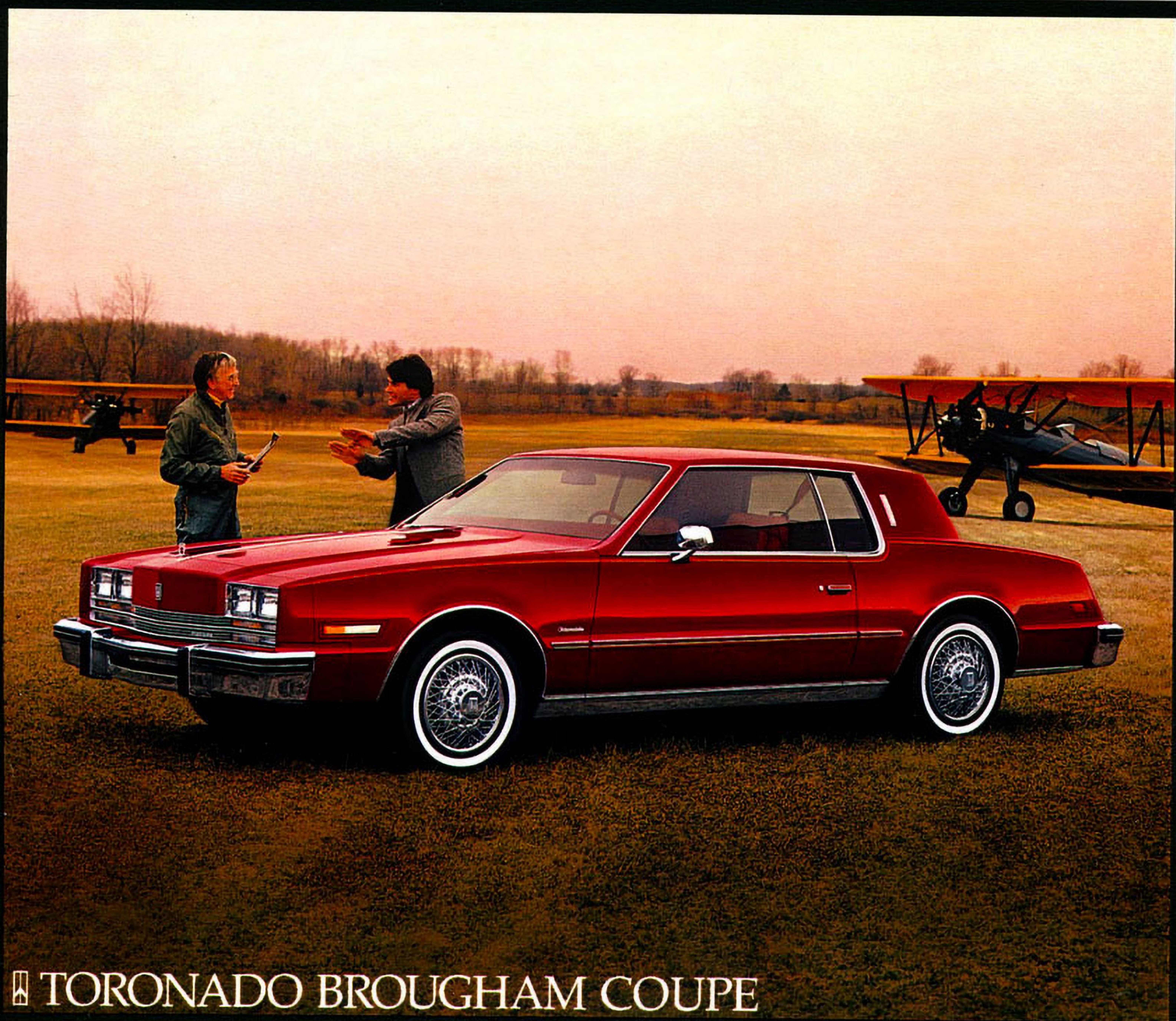
▣ TORONADO BROUGHAM COUPE