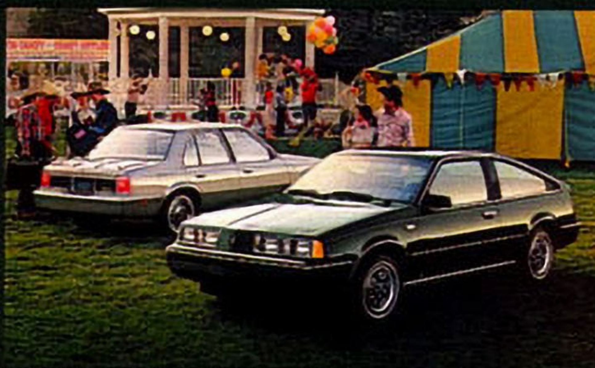
FIRENZA COUPE & SEDAN