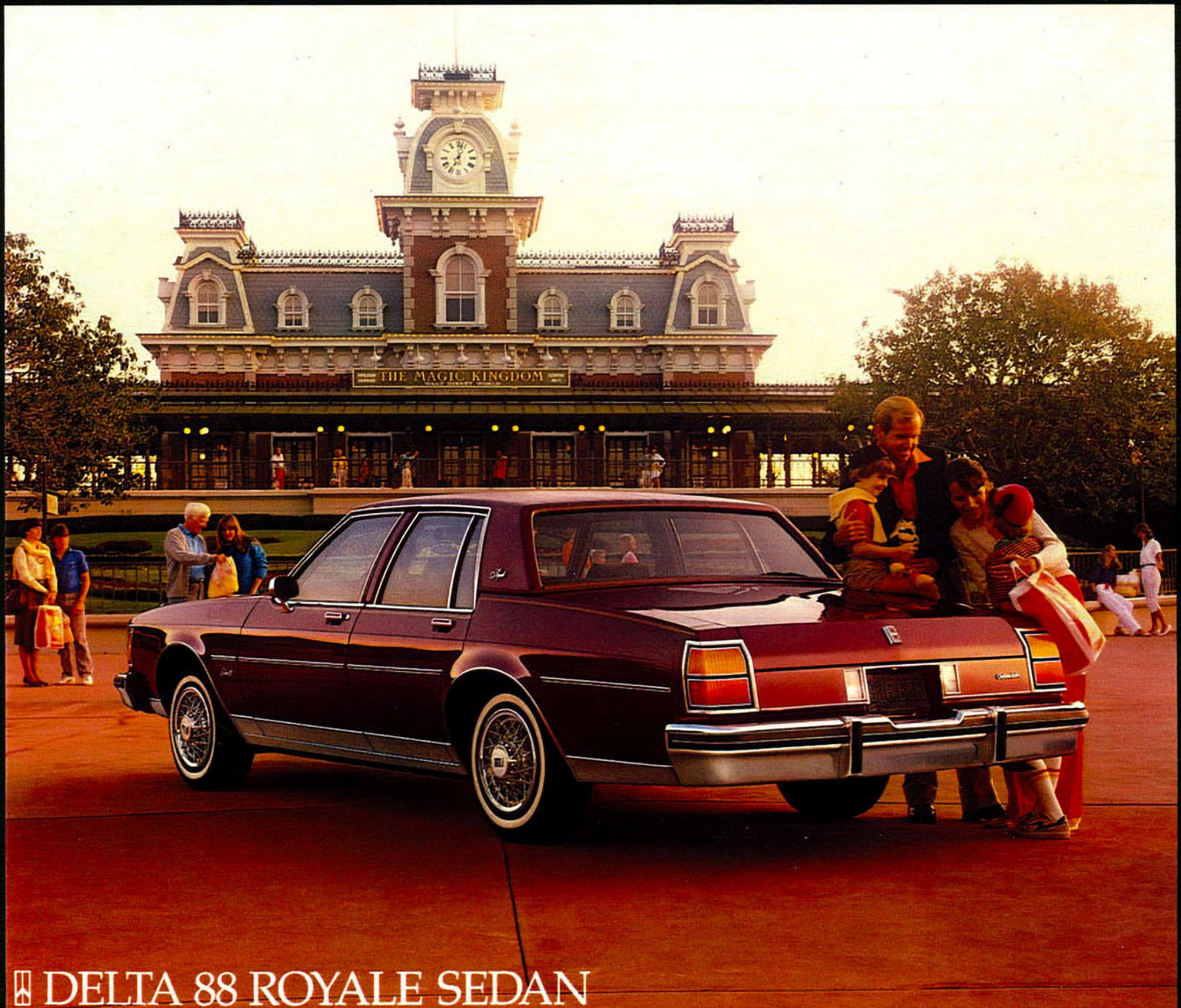
DELTA 88 ROYALE SEDAN