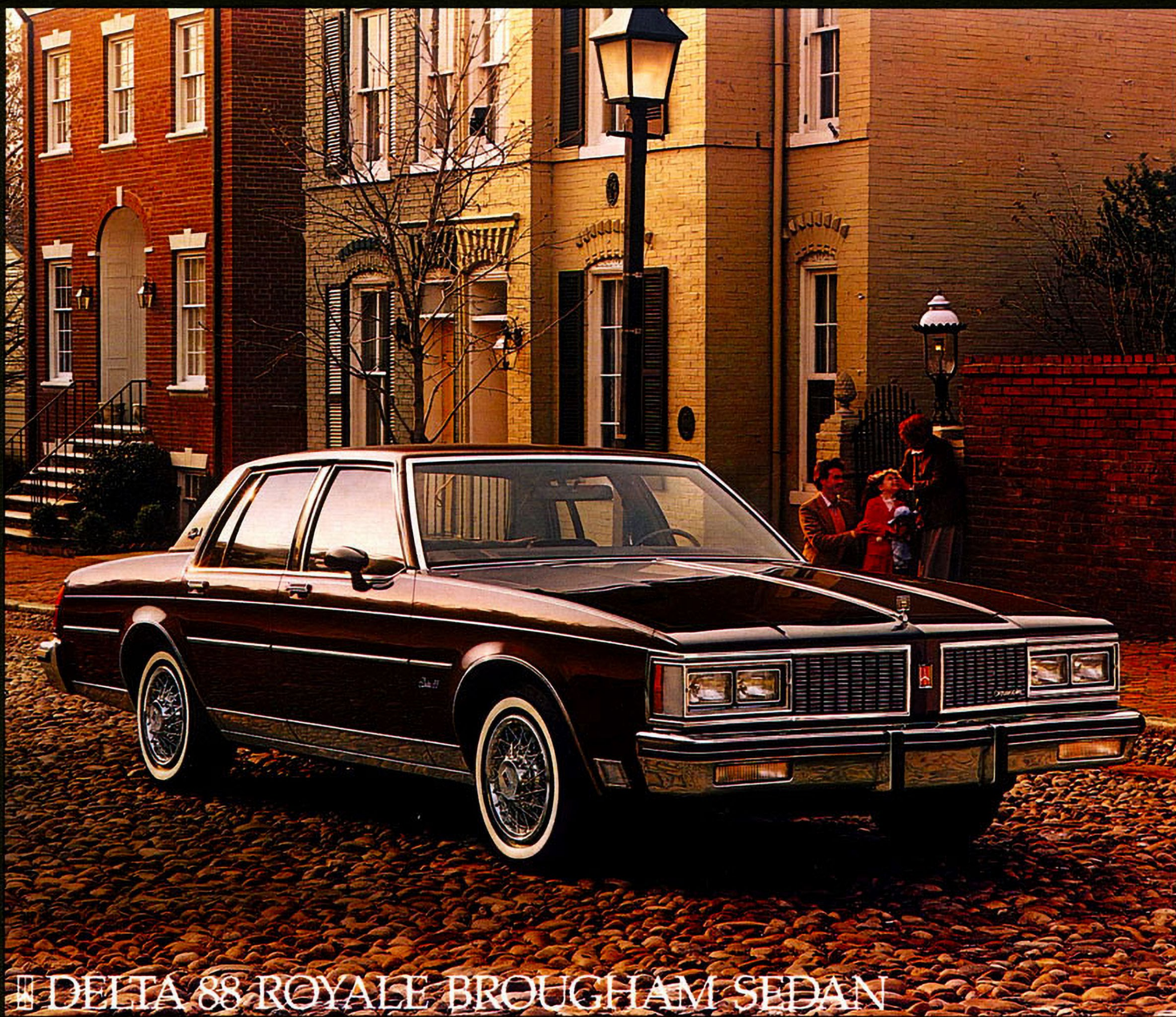
■ DELTA 88 ROYALE BROUGHAM SEDAN