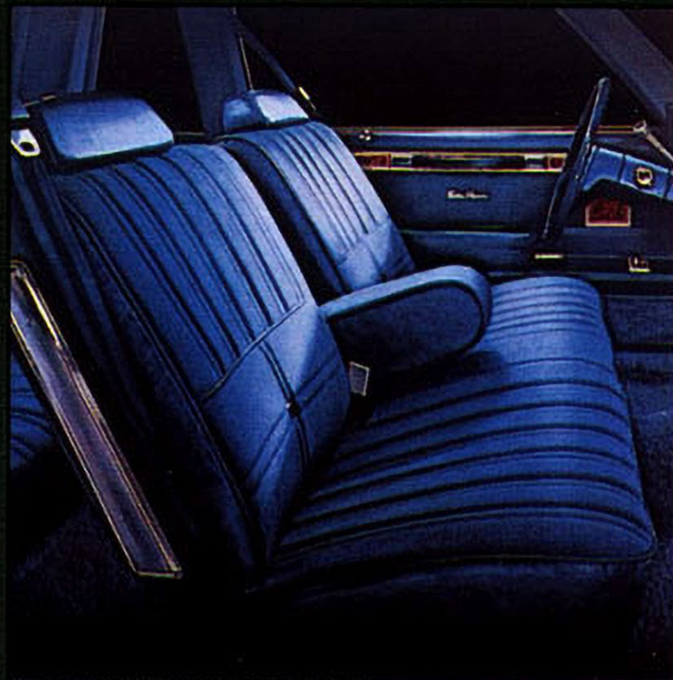
CUTLASS SUPREME INTERIOR

IT'S ALL HERE. THE STYLE. THE ELEGANCE. THE TRADITION. ALL AT A PRICE THAT MAKES THEM ALL THE MORE ENJOYABLE. Every Cutlass has its own way to win you over. With Cutlass Supreme Coupe and Sedan, it just might be affordability. Because, for all their elegance, they offer the easiest ways of all to enjoy the style, quality and value of a Supreme. With prices as attractive as the cars themselves, it's very easy to see why Cutlass Supremes are the most popular Oldsmobiles—ever. Take a test drive—and get that Supreme feeling.