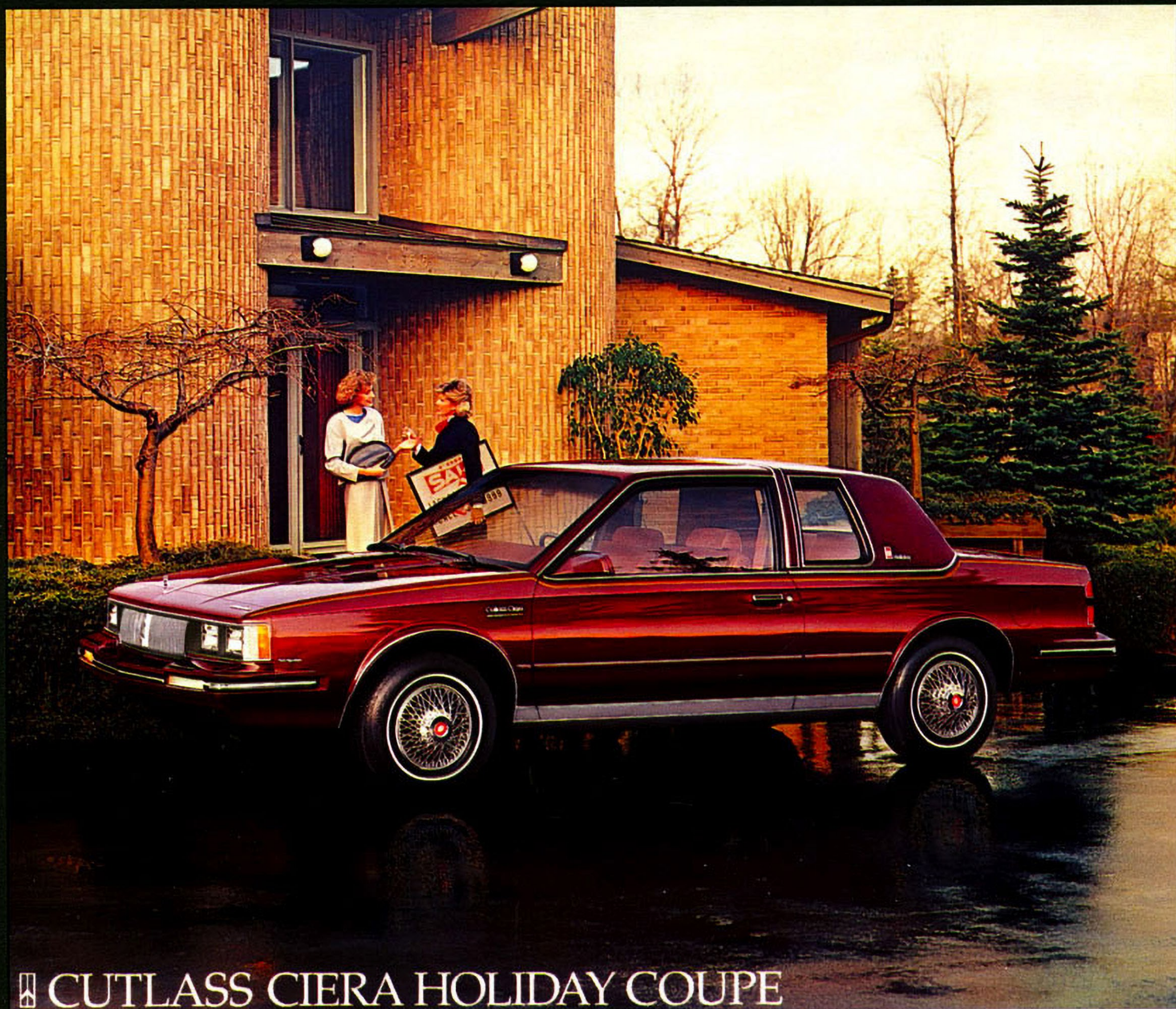
CUTLASS CIERA HOLIDAY COUPE