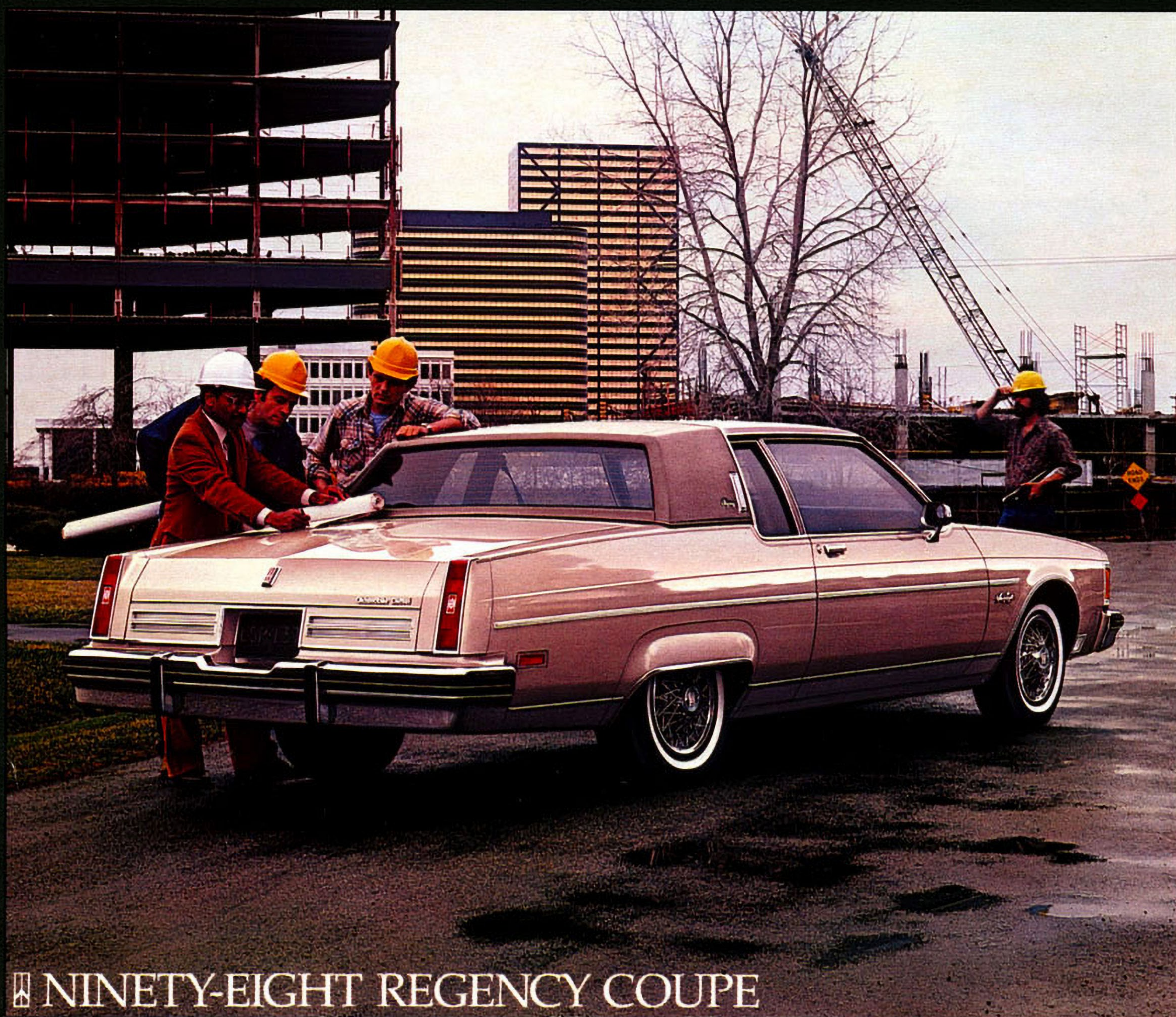
▣ NINETY-EIGHT REGENCY COUPE