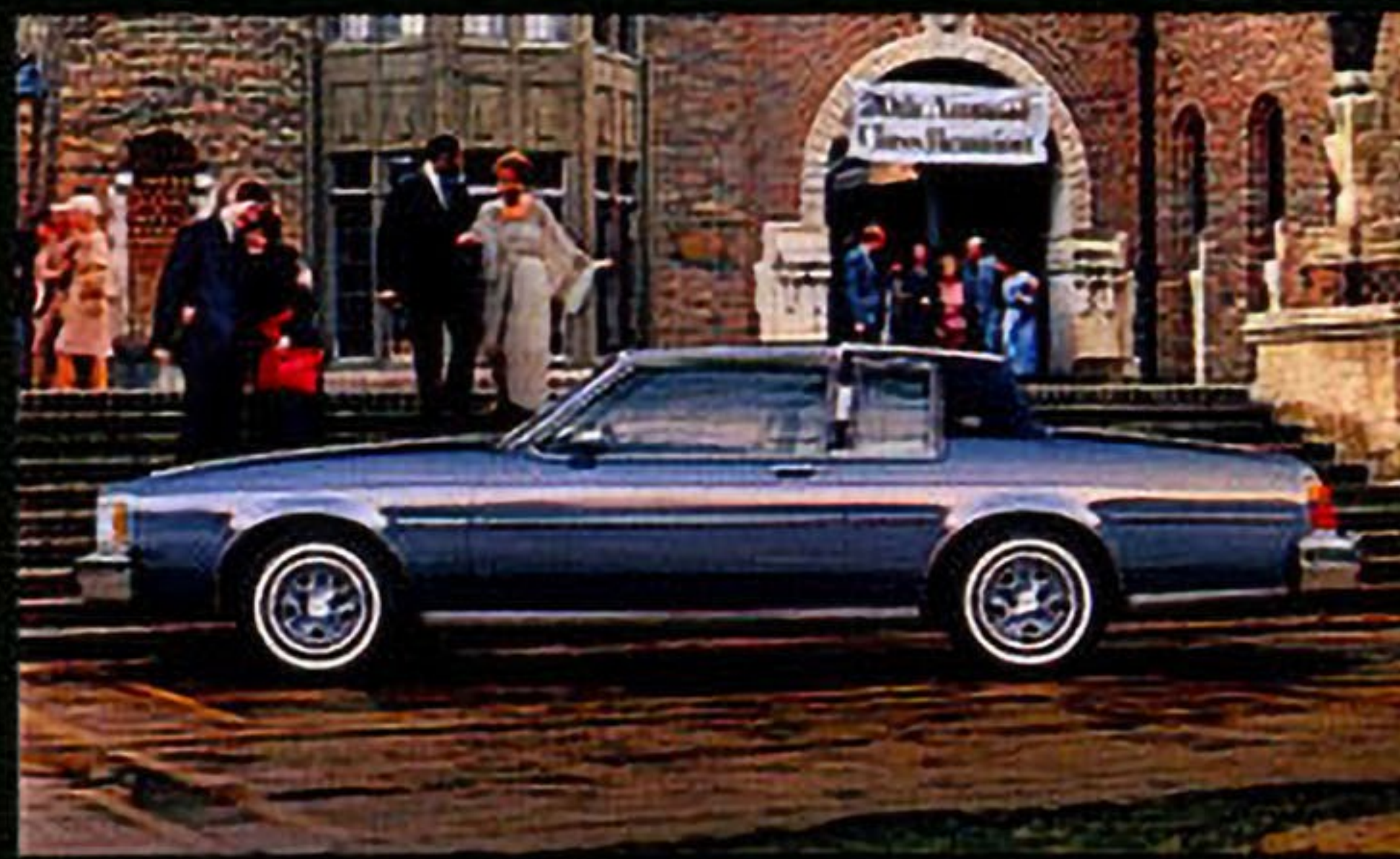
DELTA 88 ROYALE COUPE

AFTER LONG, BUSY DAYS, YOU APPRECIATE THE COMFORT OF A SMOOTH, QUIET FAMILY CAR. A trip to Disney World. Or a visit to Grandma's house. At the end of the day with a long ride ahead, everyone looks forward to the comfort of the Delta 88 Royale. Those full-foam seats are just the ticket for tired bodies. So is the gentle action of the Pliacel shock absorbers and the coil spring suspension. Extensive sound-absorbing materials add to the quiet and relaxing comfort. The value is comforting, too, and so is Delta 88 Royal's affordable price.