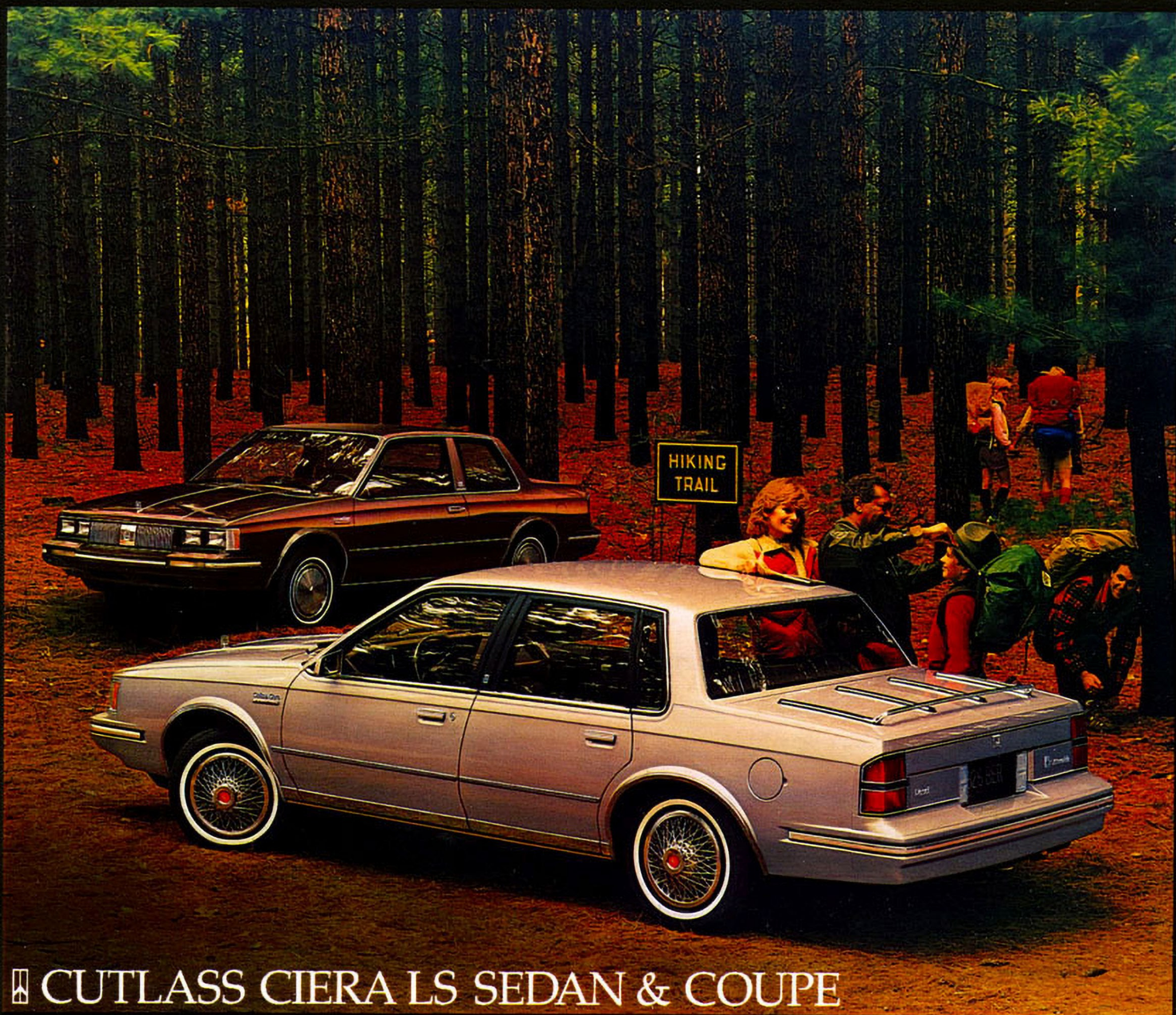
▣ CUTLASS CIERA LS SEDAN & COUPE