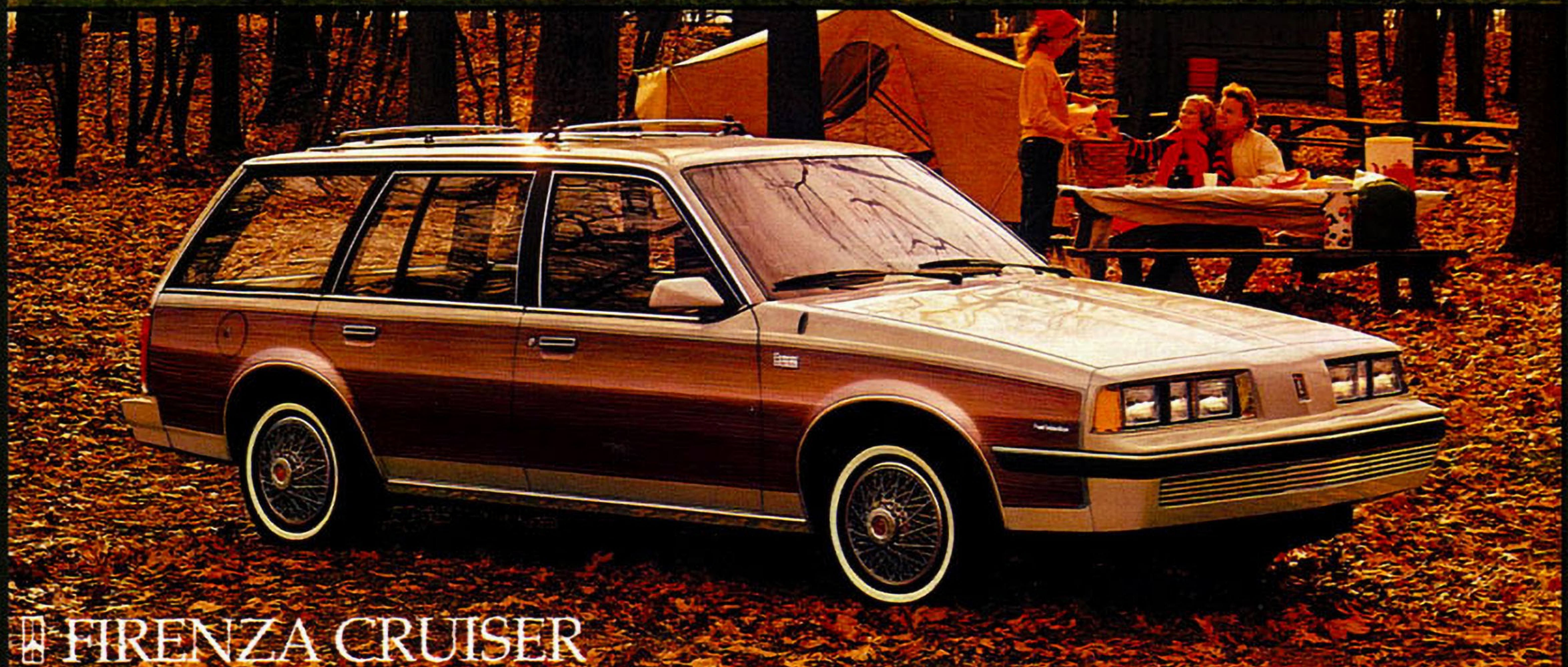
▣ FIRENZA CRUISER