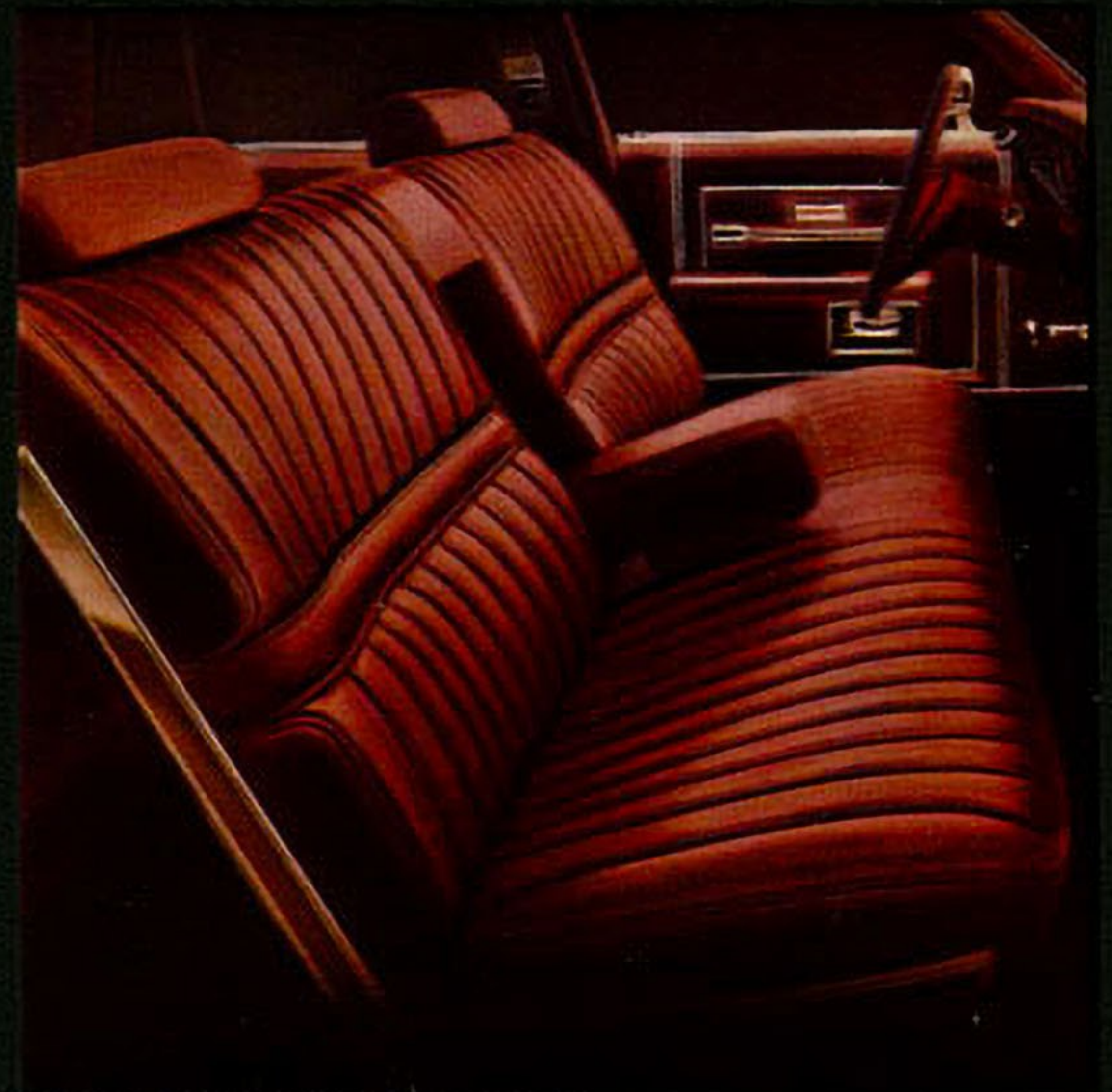
CUSTOM CRUISER INTERIOR.

GET THE WAGON CAPACITY YOU WANT WITH ELEGANT CUSTOM OR SPORTY FIRENZA CRUISER. Custom Cruiser is famous for doing the work and the town with the same elegant flair. It has 87.2 cubic feet of cargo space with second seat down. And up front full-foam seats with rich velour fabrics (or glove-soft vinyl). Like it sporty? Try Olds Firenza Cruiser. You'll take to it as naturally as it takes to the road. Inside, with back seat folded down, 63.4 cubic feet of carpeted cargo area. Plus, both wagons offer a choice of available engines. Go cruising . . . Olds style.