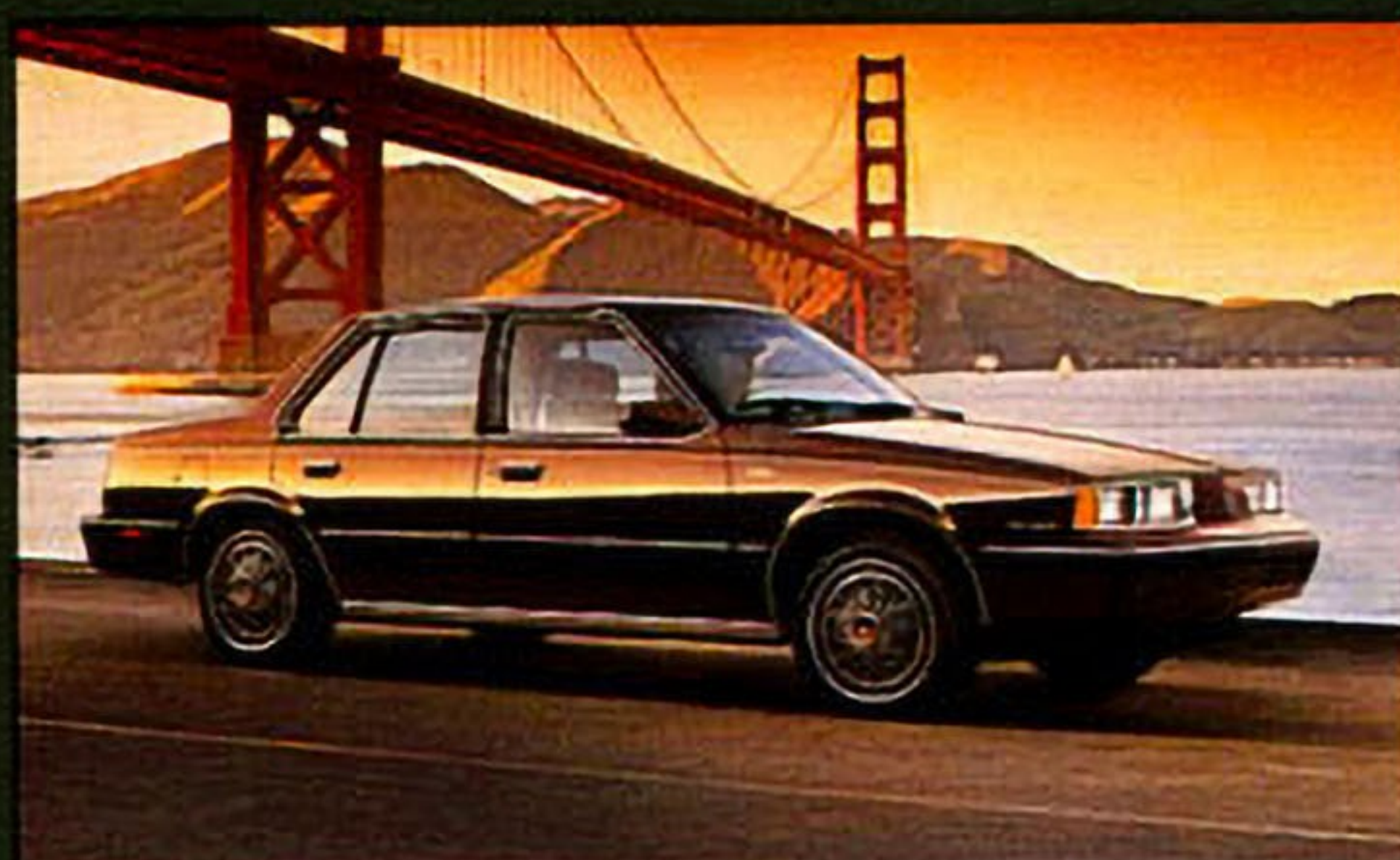
FIRENZA LX SEDAN

THIS SPORTY FUN-TO-DRIVE CAR NEEDS NO COACHING WHEN IT COMES TO HAVING A GOOD TIME. From the first feel of the wheel, you'll perceive a special kind of excitement that Firenza SX brings to the road. Feel the steady power of its standard 2.0-liter electronic fuel injected engine, or available 1.8-liter overhead cam engine, also with electronic fuel injection. Feel the precision of its 4 on the floor or available 5-speed manual transmission...and you've just shifted one step further along the road to driving enjoyment.