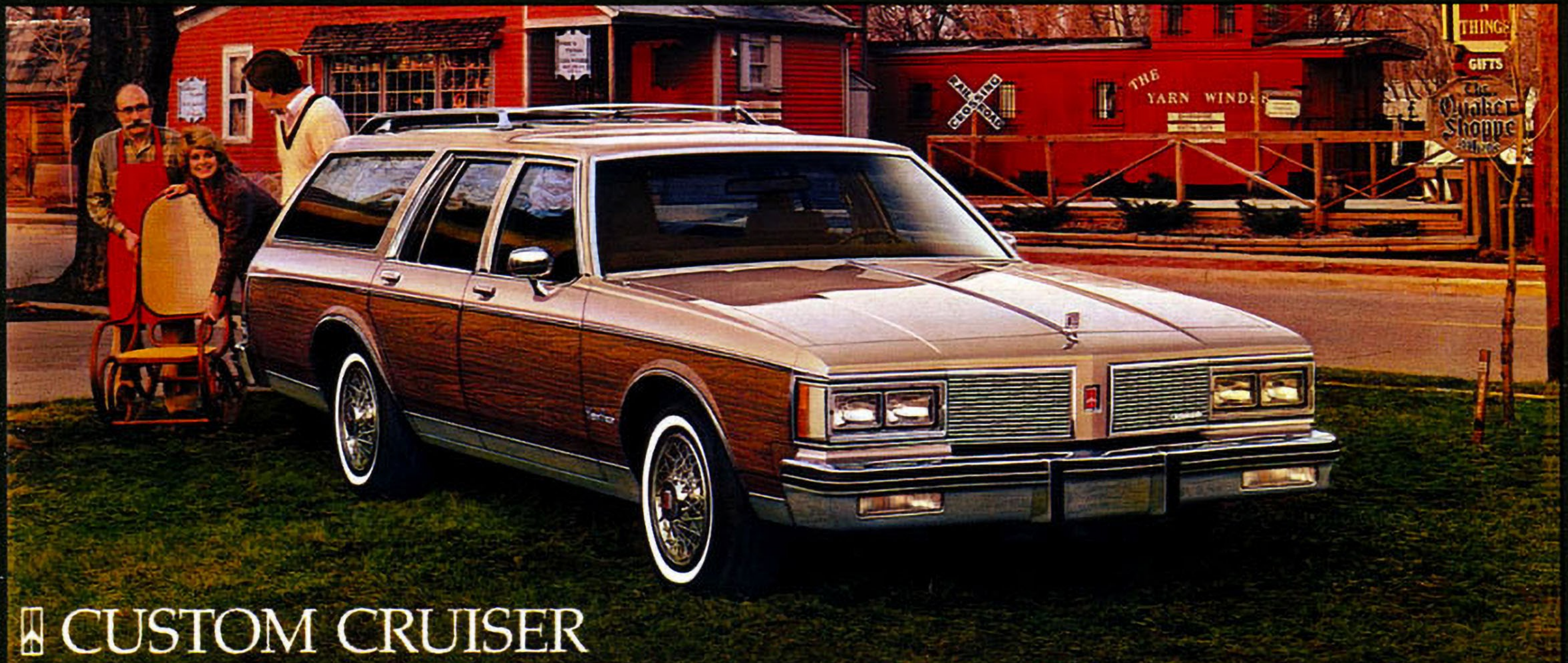
▣ CUSTOM CRUISER

GET THE WAGON CAPACITY YOU WANT WITH ELEGANT CUSTOM OR SPORTY FIRENZA CRUISER. Custom Cruiser is famous for doing the work and the town with the same elegant flair. It has 87.2 cubic feet of cargo space with second seat down. And up front full-foam seats with rich velour fabrics (or glove-soft vinyl). Like it sporty? Try Olds Firenza Cruiser. You'll take to it as naturally as it takes to the road. Inside, with back seat folded down, 63.4 cubic feet of carpeted cargo area. Plus, both wagons offer a choice of available engines. Go cruising . . . Olds style.