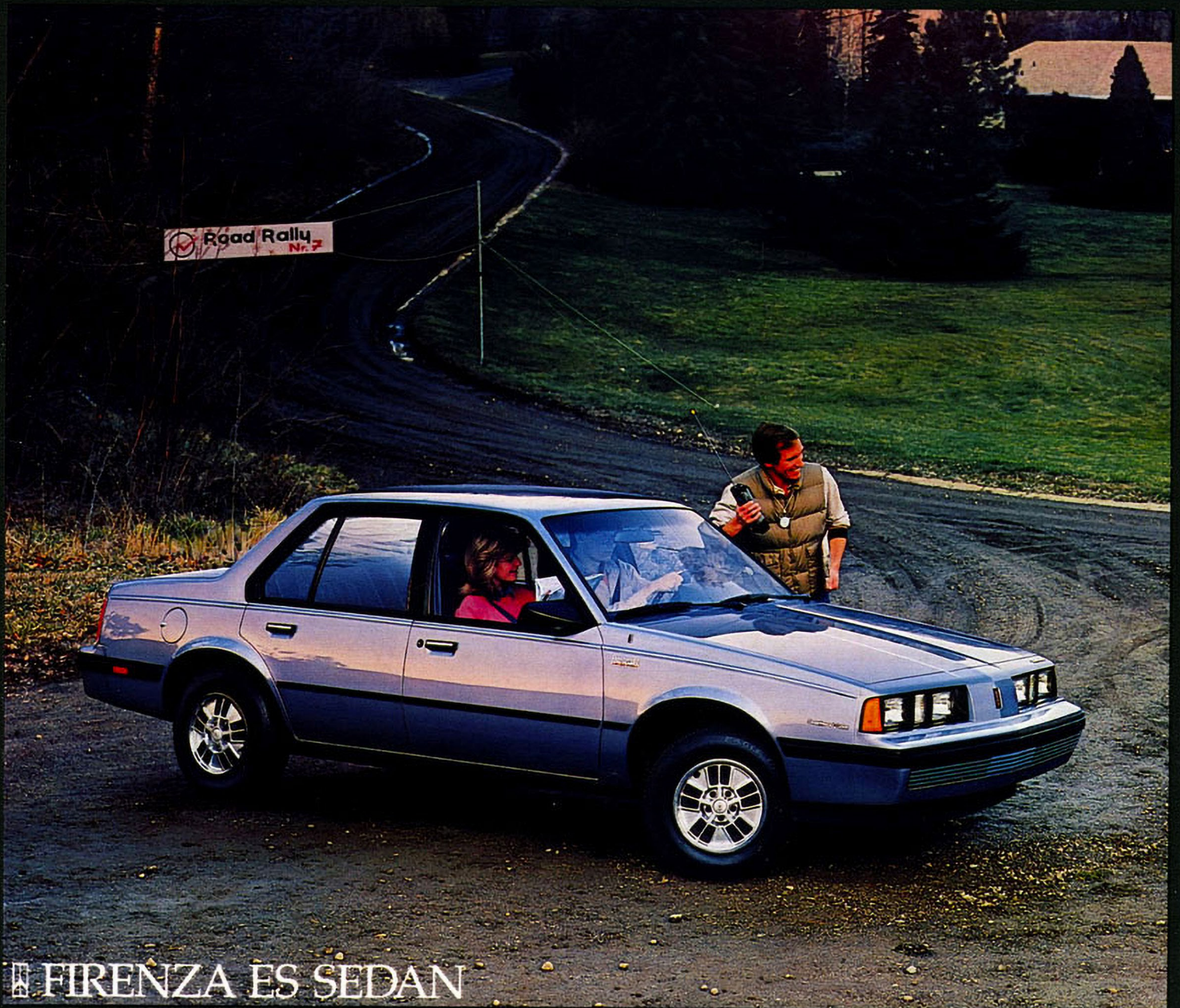
FIRENZA ES SEDAN

NOW THAT YOU'VE FOUND YOUR WAY TO FUN AND COMFORT... RELAX AND ENJOY IT. This is what a front-wheel-drive, grand-touring sedan can be when it's an Oldsmobile. Extra special—with black body side moldings and accent trim, special accent stripes, styled wheels and more. Under the hood, spirited engines that really know how to scramble. Like the optional 1.8-liter L4 electronic fuel injected overhead cam engine that you can team with the available 5-speed manual transmission. If you love driving, you've got to get your hands on this one.