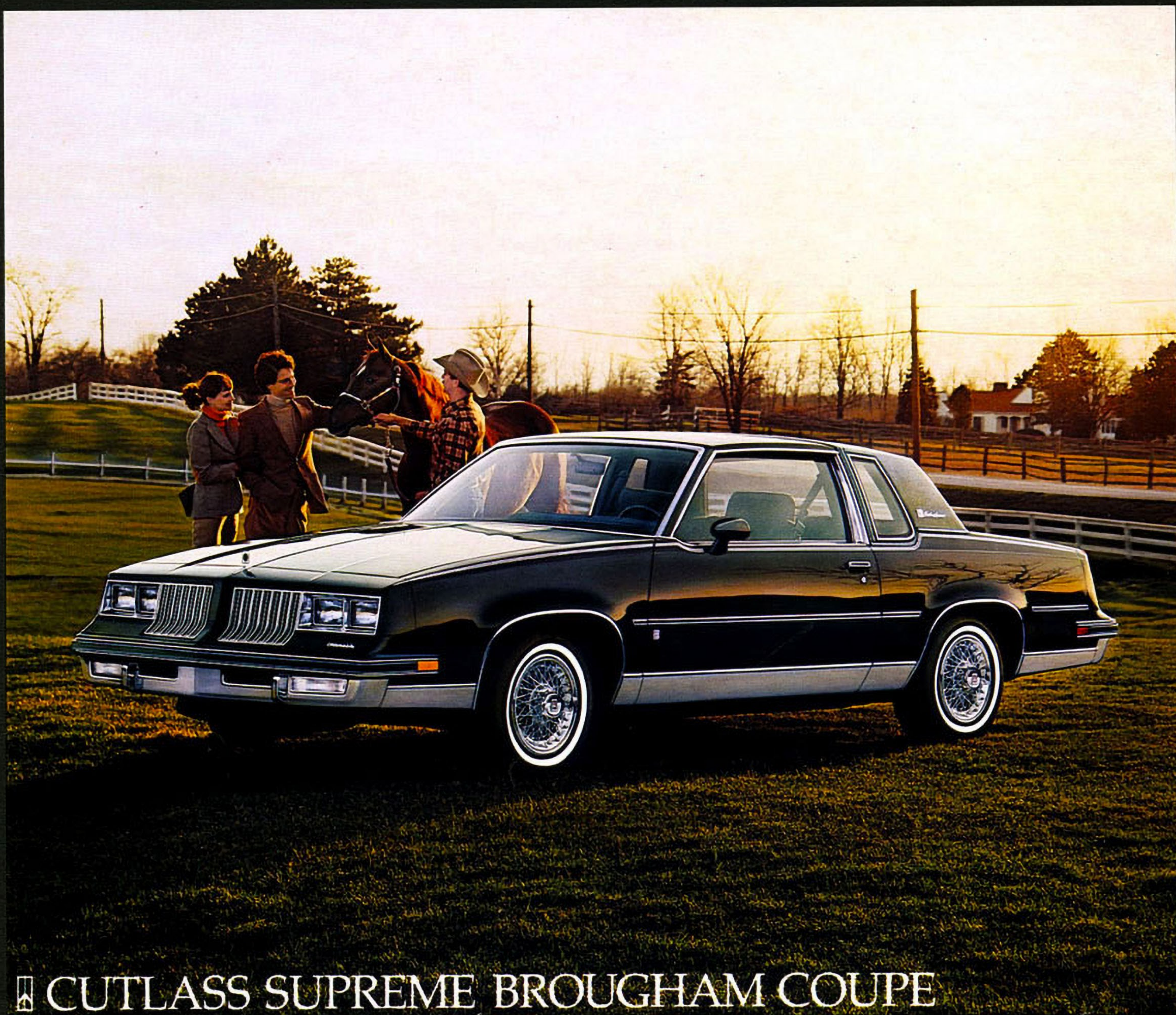
⌘ CUTLASS SUPREME BROUGHAM COUPE