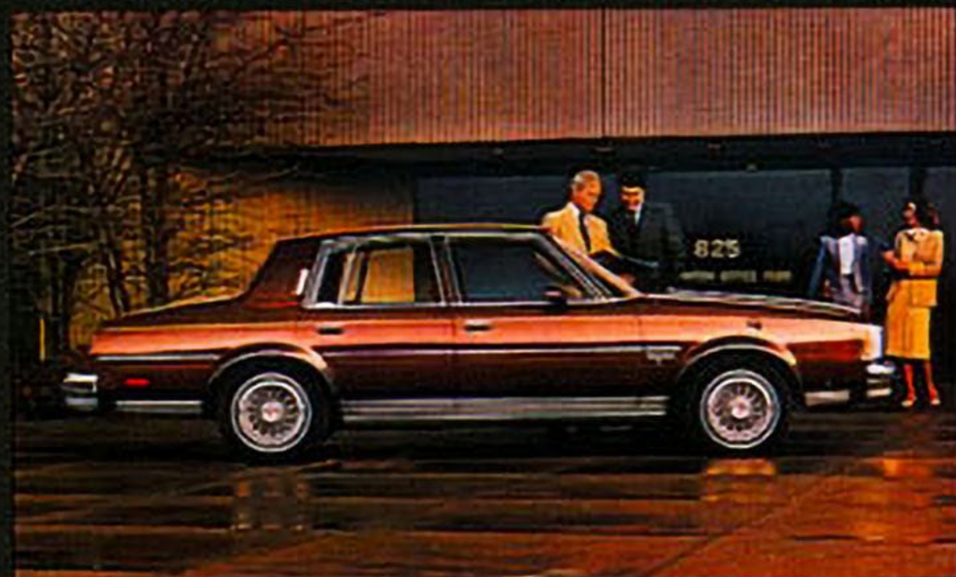
CUTLASS SUPREME BROUGHAM SEDAN

YOU KNOW FROM THE STYLE, GRACE AND UNEQUALLED TRACK RECORD THAT THIS IS A THOROUGHbred. Cutlass Supreme Brougham comes from classic stock—bred from a proud heritage of style and grace. And from a great winning tradition. In fact, over the last nine years, Cutlass Supreme has outsold every other mid-size car in America, regardless of price. Here's a contemporary classic with the look of a thoroughbred and the class of a champion. And you feel it—every time you take a ride. Plan to take a ride real soon.