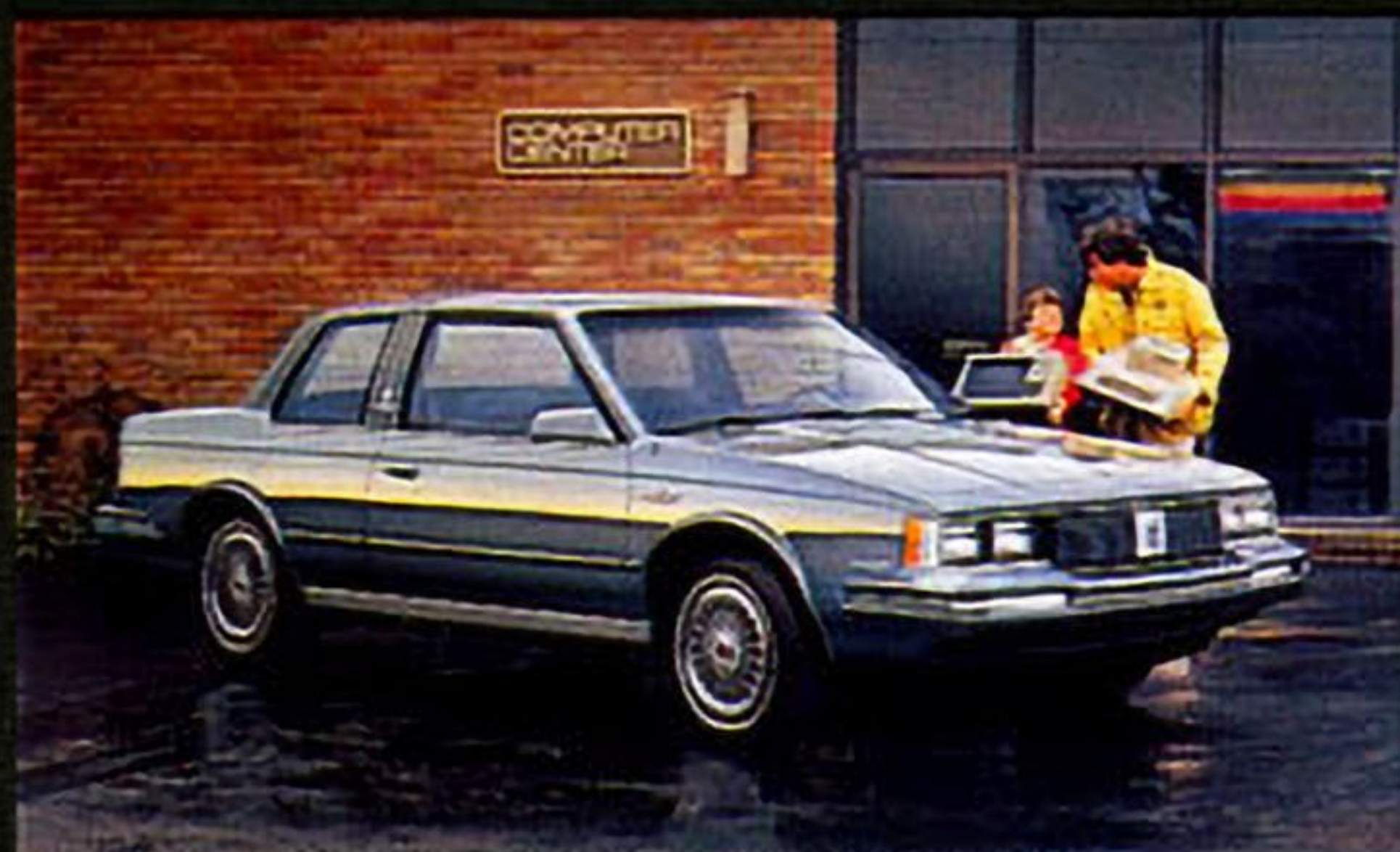
CUTLASS CIERA BROUGHAM COUPE

IT FEELS LIKE STEPPING INTO THE FUTURE—IN STYLE AND TECHNOLOGY. It's the most advanced front-wheel-drive, mid-size ever offered by Oldsmobile. Designed with the aid of computers, built and tested with robots and lasers, it is a high technology front-wheel-drive car that lives up to your most rigorous expectations. You can even order the available electronic instrumentation with analog graphs and digital readouts. Cutlass Ciera Brougham—latest edition in the Cutlass tradition. No wonder it's one of America's fastest-growing mid-size cars.