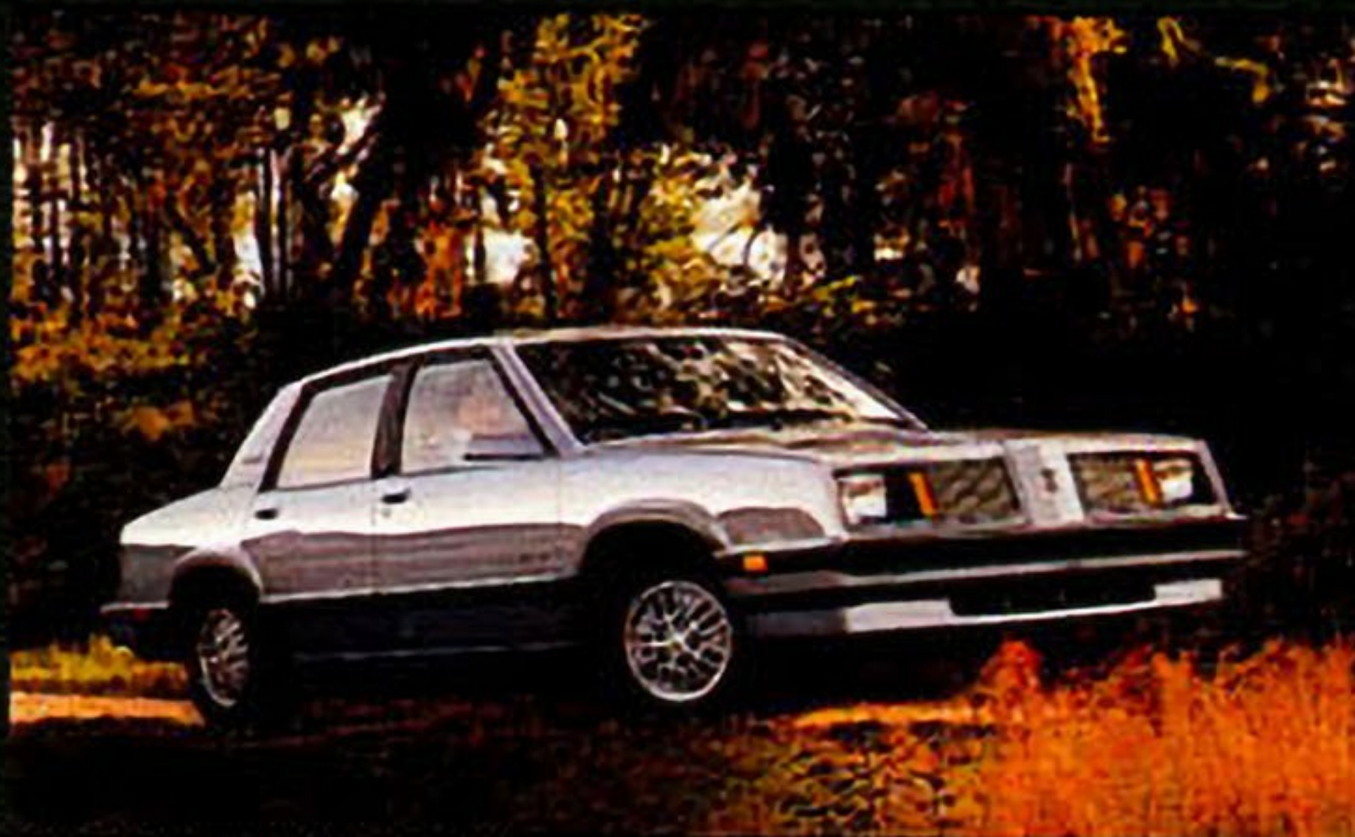
OMEGA ES SEDAN

WHEN IT'S COMFORTABLE ON THE ONE HAND, AND AFFORDABLE ON THE OTHER, IT MAKES FOR A GREAT MATCH. Choose either front-wheel-drive Omega Coupe or Sedan and get a level of comfort and quality that's strictly Oldsmobile. Little things that mean a lot like: Olds Omega's comfortable custom bench seating with full-foam and fold-down center armrest, plus fuel efficient 2.5-liter L4 electronic fuel injected engine. Comfortable on the one hand, affordable on the other; it's been an Olds Omega hallmark for years.