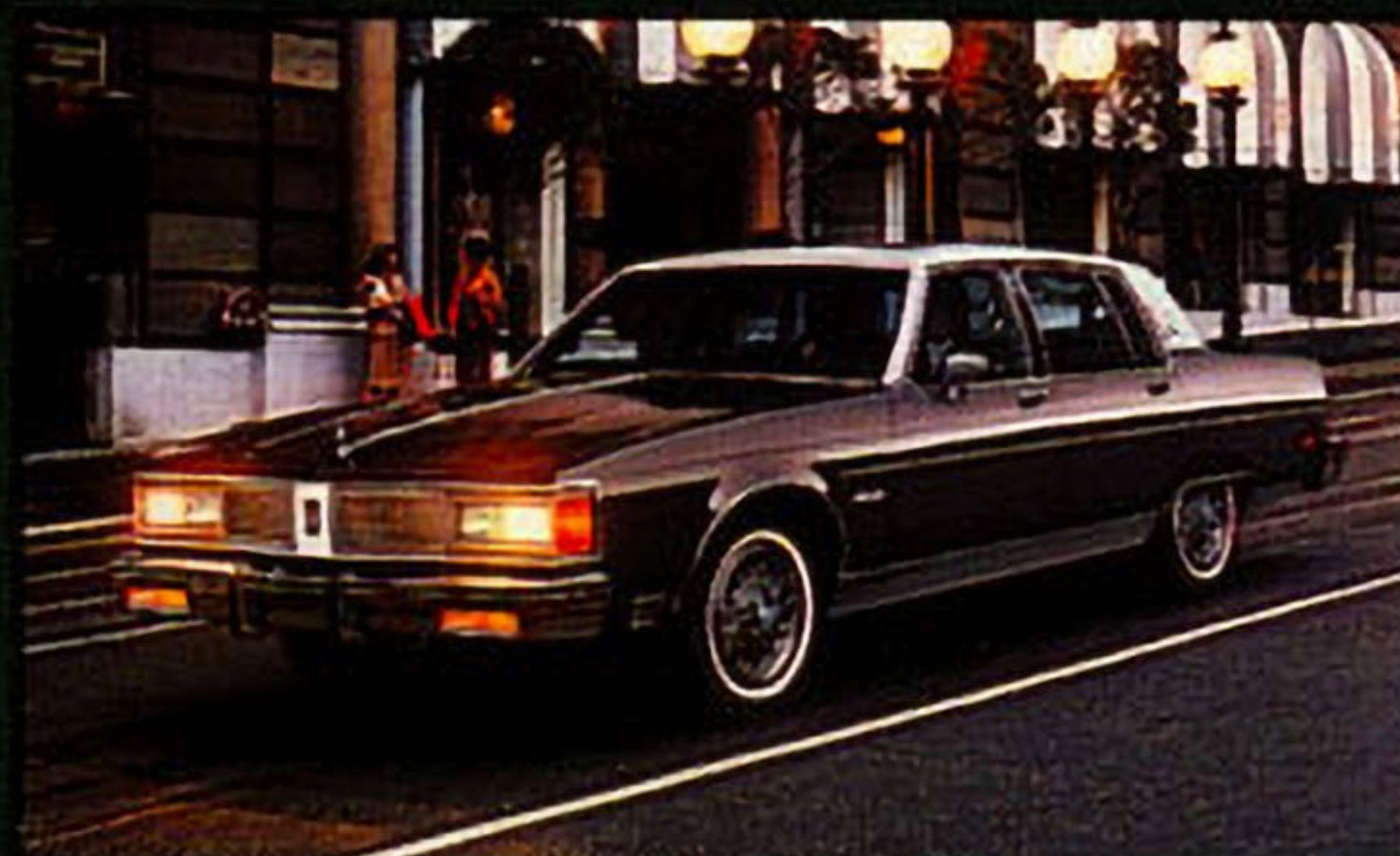
NINETY-EIGHT REGENCY SEDAN

YOU KNOW WHAT IT TAKES TO MAKE THINGS RIGHT. FOR YOU THE "THINKING MAN'S LUXURY CAR" MAKES SENSE. Sure, you like impressive lines, but what about the bottom line? Are you getting what you pay for? You like lavish interiors, but what about quality and solid engineering? Good performance, of course, but what about economy? The more you think about these things, the more a Ninety-Eight Regency makes sense. It's a logical luxury car choice. Why not get all the facts at your nearest Oldsmobile dealer?