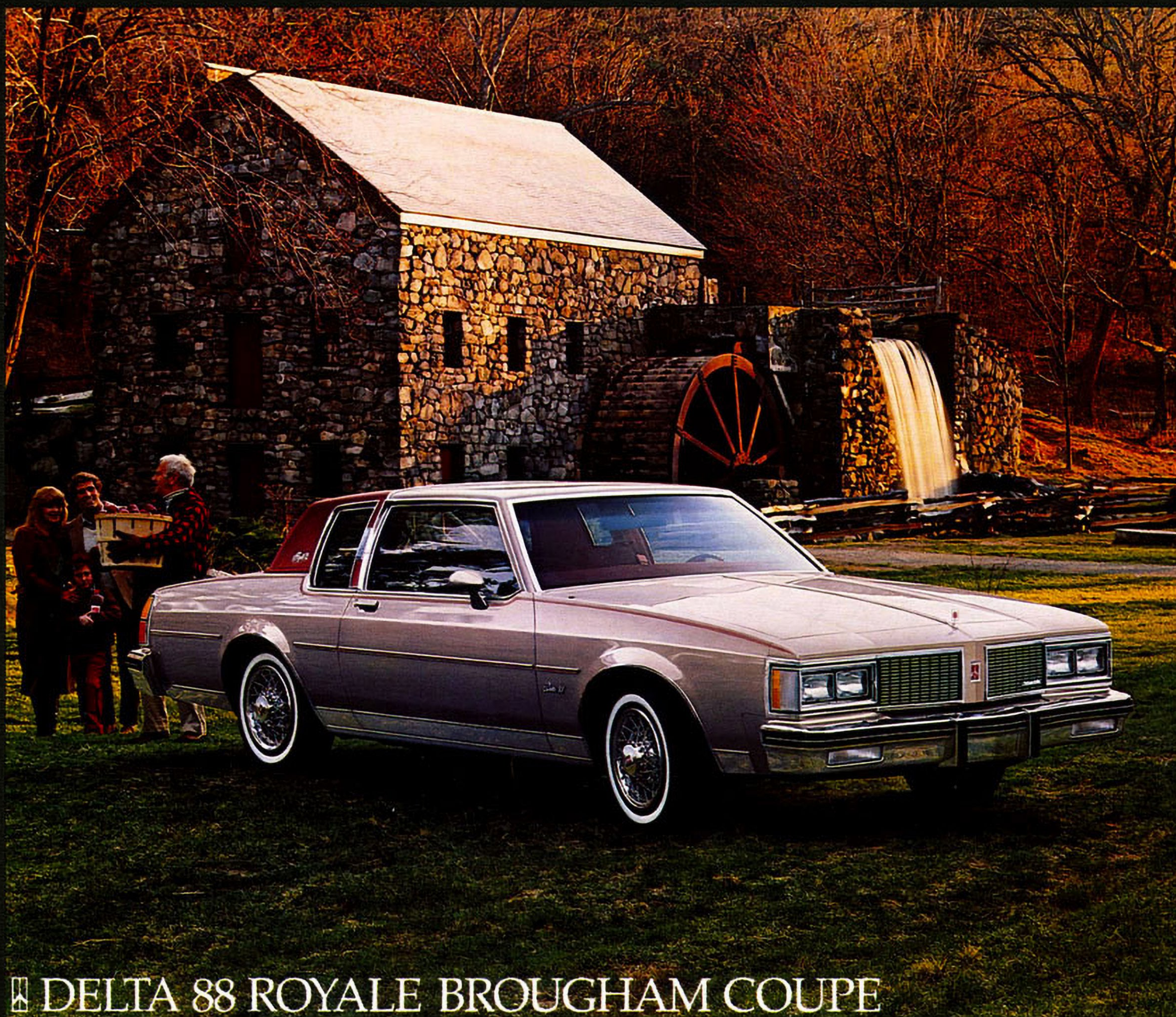
DELTA 88 ROYALE BROUGHAM COUPE